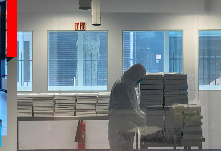
First ETHIZIA™ batch ready for shipment 04MAR2024